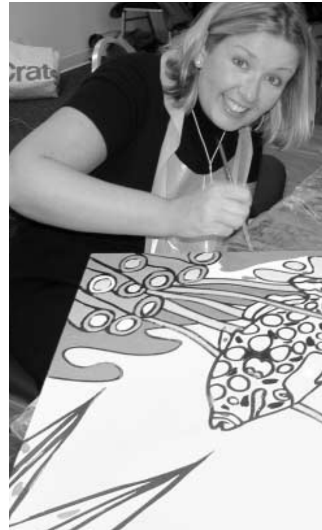
Turner Broadcasting Systems employees in town for a meeting took time to color some canvases at Atlanta's CNN Center.