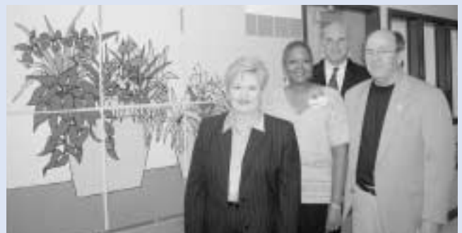
Official presentation of artwork to Grady Memorial Hospital, Atlanta, GA.