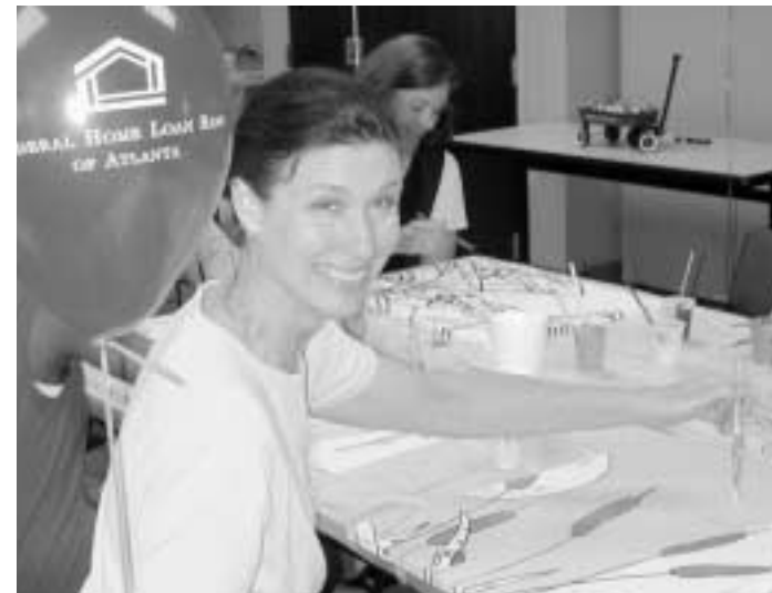
Here, an employee of Federal Home Loan Bank of Atlanta, one of the Foundation's dedicated sponsors, participates in an annual In-Office PaintFest. The Foundation wishes to express its sincerest gratitude to FHLB for its support over the years, which includes the underwriting of this newsletter's production.

"Our company PaintFest event is the most popular and well attended "in-office" community involvement activity of the year! Our employees love the atmosphere, painting activity, conversation, and teambuilding to accomplish a very tangible and worthwhile end result ...making hospitals more colorful places for everyone."