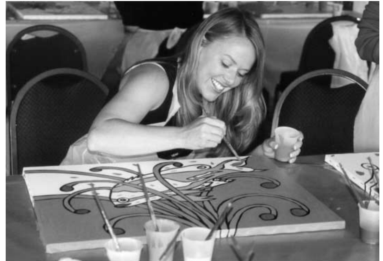
This Ingram Micro PaintFest did double duty: it served as a great ice-breaker activity to get people connected and it also united participants in an effort to reach out to people in hospitals.