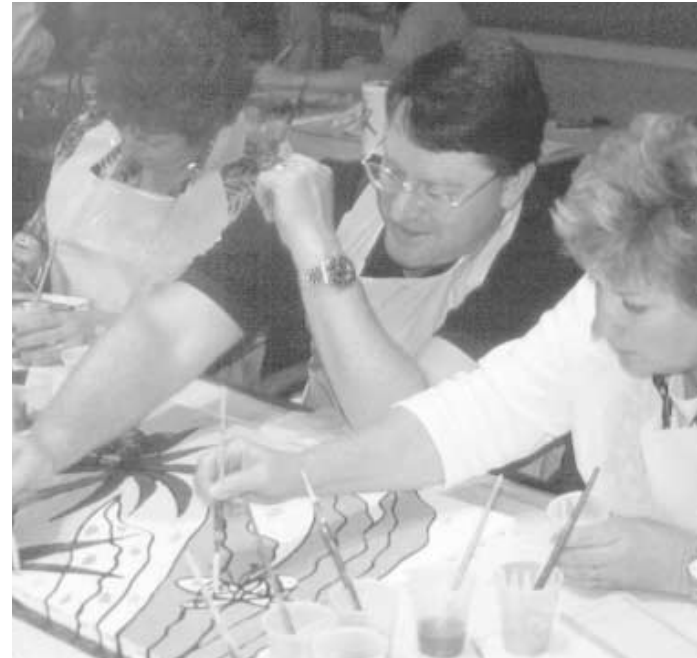
Here, Janssen employees in Titusville, NJ work together to create a lush jungle.