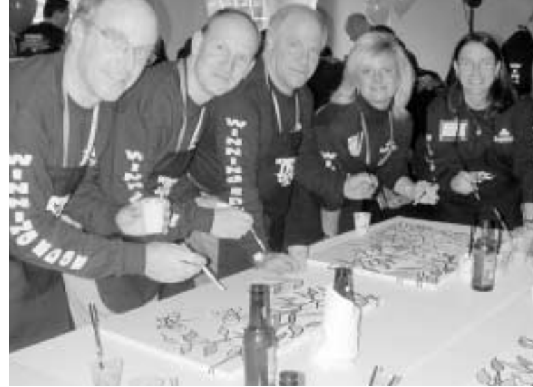
The Georgia-Pacific Retail Sales Division teamed-up to paint for patients at the Chateau Elan Resort & Winery.