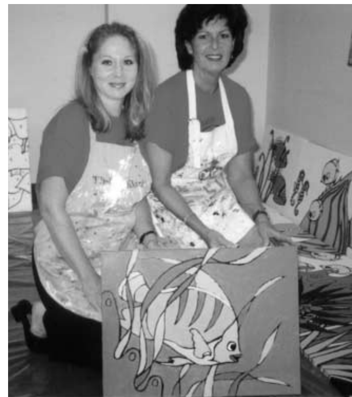
Lend Lease Real Estate Investment's third annual In-Office PaintFest was a hit. Everyone had fun working together for a good cause.