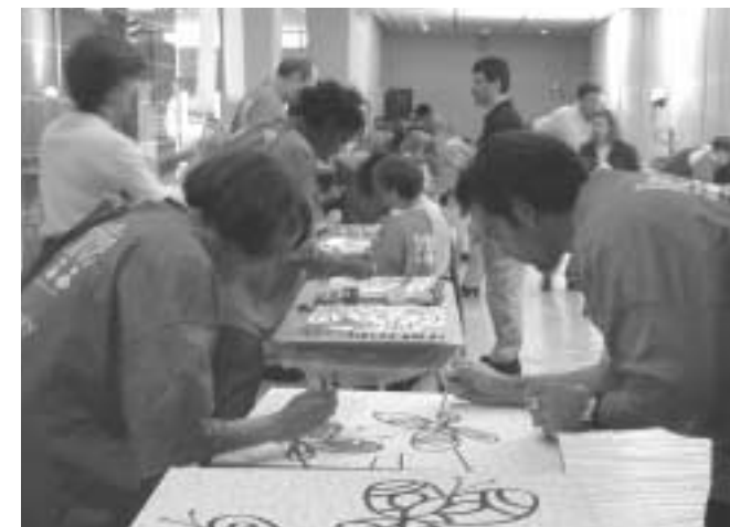
Painters at Georgia-Pacific's Annual Headquarters PaintFest participate without leaving the office building.

"Besides changing the look of our hospital walls, you brought magic and mostly you left your spirit and courage in the war against pain [and] loneliness."