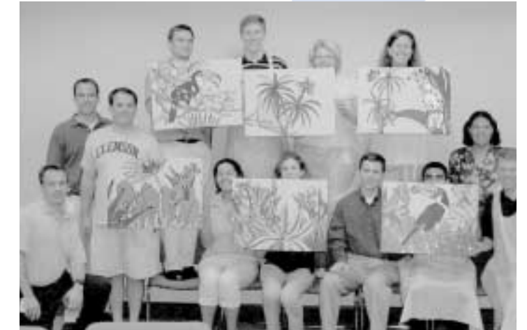
When the work's done, the painting begins! This group from Manhattan & Associates mingled and chatted over drinks and snacks at an after-work In-Office PaintFest. The paintings eventually went to the Shepherd Center in Atlanta. Contact the Foundation for more on how to bring a PaintFest to your office.