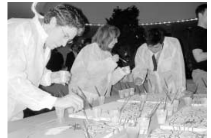
Doctors recognize the healing power of art. Cardiologists at this conference painted for local hospitals courtesy of Astrazeneca International.