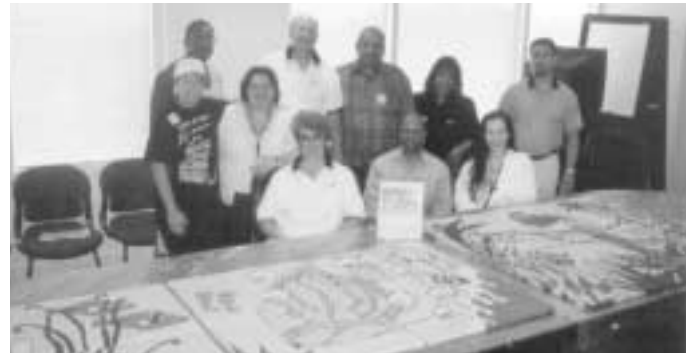
There's always time for a PaintFest! Above, employees of Fujitsu in Atlanta, GA painted for hospitals in their conference room.

PaintFests aren't restricted to hospitals or institutions. We can bring color to your workplace through In-Office PaintFests. Employees unable to leave the premises to participate in off-site activities love the opportunity to paint in their break rooms or conference rooms, knowing that the work they're doing in their office will do much to ease the suffering of others many miles away.