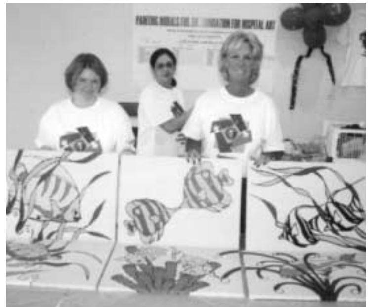
Ciba Vision's annual Community Service Day PaintFests take place in four Atlanta locations and one location in Illinois. For the staff members that are unable to leave the Ciba Vision premises and participate in off-site activities, the annual PaintFests are the perfect solution.