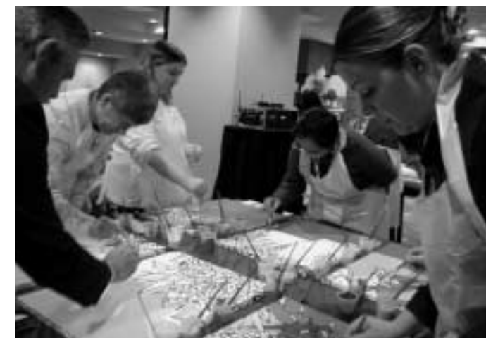
Spouses of Infosys meeting attendees created colorful paintings for hospitals at Marriott's Evergreen Conference Center in Stone Mountain, Georgia.